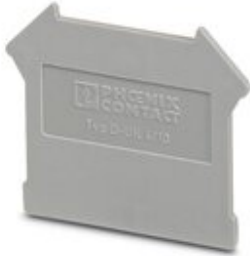
End cover, length: 42.5 mm, width: 1.8 mm, height: 35.9 mm, color: gray

Please be informed that the data shown in this PDF Document is generated from our Online Catalog. Please find the complete data in the user's documentation. Our General Terms of Use for Downloads are valid ( http://phoenixcontact.com/download )